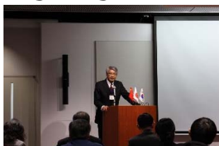
〈Project leader's greeting〉