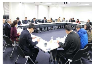
〈International faculty meeting〉