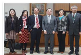
〈MOU with 5 universities / 7 organizations〉