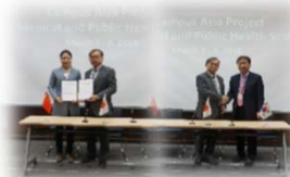
〈DDP with 2 universities〉