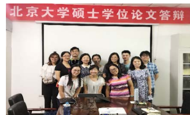
〈Student exchange: Peking University〉