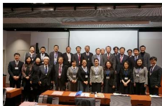
〈International symposium〉 〈TypeA-②〉