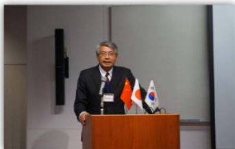
〈Project leader's greeting〉