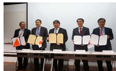
〈Ceremony for agreement and MOU〉

Faculty meetings among partner universities in Campus Asia was held to discuss the agreement framework for credit transfer, grades management, academic degrees as well as student support. The exchanges in information and discussion among the faculties were achieved through the faculty meeting, the international symposium and seminars between the partner departments. Double-degree program will be aimed for Ph.D. candidate students through studies in the home and the counterpart universities to receive lectures and practices and to conduct research and to be mentored for doctoral dissertation by faculties in both universities. When the conditions for acquiring Ph.D. degrees at both universities are fulfilled, the degree will be granted to the student by each university.