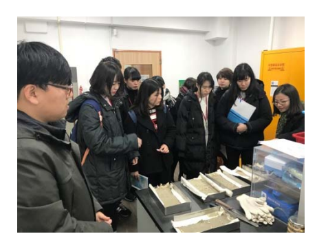
Laboratory tour on Short-term visit program at Korea Maritime and Ocean University