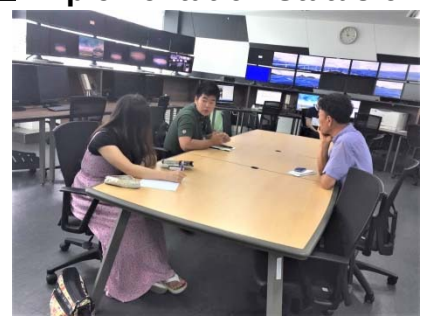
Meetings in advance of embarking on the International Joint Program (IJP) at Korea Maritime and Ocean university

■ Implementation Status of the Exchange Program