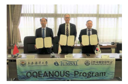
Conclusion of a Double Degree Agreement and Agreement Relating to Credit Transfer Among Maritime Universities @ TUMSAT

Provision of scholarships and accommodation for students placed overseas and accepted in Japan have been incorporated into the agreement for this project and are being steadily implemented in keeping with this agreement. After efforts have been made to share specific contents among the three universities at the meeting, these are disseminated in student application guidelines, web sites, and other media.