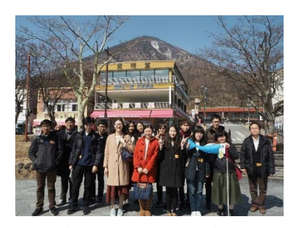
(Spring Camp in Nikko)