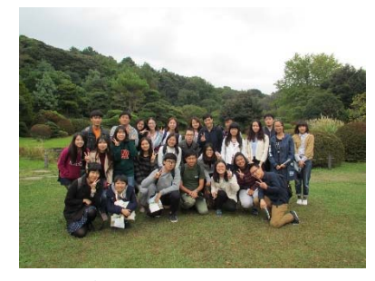
⟨Off-campus Learning at Koishikawa Botanical Garden⟩