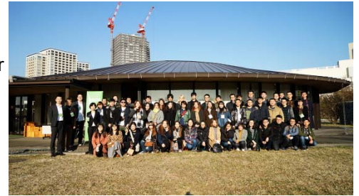
Chiba University CAPE Winter Workshop in FY 2016

In FY 2016, Chiba University, Tsinghua University and Zhejiang University in China, and Yonsei University in Korea each held at least one workshop for a total of five. A total of 263 students (including students not from partner universities) participated. An international symposium where faculty members and students from each university presented their research was held at the Kashinoha Campus, Chiba University in February. In FY 2017, each university continues to offer workshops as well as aims to increase the number of students participating in long-term study abroad programs.