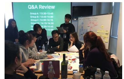
The joint workshop at Yonsei University, Korea

High quality workshops, which are in cooperation with partner universities, private businesses, and public offices, are implemented. Quality is ensured by mandating that each partner university send at least one faculty member to each workshop and requiring participants to study before and after each workshop. Afterwards, students who participate in the workshops are given a certificate of completion as well as credits after their work is graded. At Chiba University, all the courses offered in this program are considered graduate-level general education subjects and are registered as common courses among graduate schools.