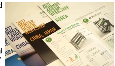
Brochures by program

Information about the CAPE (Campus Asia Plant Environment innovation) project and the achievement of workshops is available online ( http://design-cu.xsrv.jp/cape/index.html ). In addition, we distributed brochures on all these programs in English. On the Nishi Chiba Campus, as part of our efforts to disseminate information, we also demonstrated our research on urban beekeeping, which constitutes part of the project, and encouraged visitors to participate in practical experiences such as collecting honey. During the IASDR (International Association of Societies of Design Research) congress held at the University of Cincinnati last October, we presented on design education. Moreover, we presented the results of our workshops at a public symposium held at Yonsei University in January.