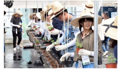
2017 Summer program in South Korea

In FY 2017, we conducted 11 programs (Excellent Summer Winter Programs) with partner universities, namely six at Chiba University, three in China, and two in South Korea, to promote student mobility and studying abroad. A total of 310 students (103 Japanese, 121 Chinese, 74 Korean, and 12 from other countries) participated. With an emphasis on industry-academia-government practical programs, we benefited from cooperation with KLITE, a lighting manufacturing company based in Zhejiang, China; KT (Korea Telecom), the largest telecommunication company in South Korea; and Chiba City Hall. In addition to deepening the relationships with our partner universities and companies, these exchange programs drastically advanced our education, research, and internship activities.