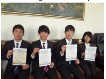
\( \) Students of Niigata University with certificates of completion \)

Construction of the global framework promoting the collaborative education and career development for young medical students in Japan and Russia