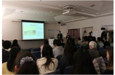
Russian students making presentation at the public lecture)

"Control Center" (consists of four staff members who can speak English or Russian) belongs to the School of Medicine, administrates and manages the project in cooperation with Academic Affairs Division, strictly ensuring academic progress and following credit transfer system. 2015 is the first year when actual results were gotten, so starting from the next year in order to make outbound/inbound students' academic and research achievements transparent, we will do our best to apply credit transfer system to all types of programs. Various Evaluation Committees and Internal/External Steering Committees meetings have been regularly hold, all the results thoroughly checked and advice given by experts followed in order to carry out the following project industriously.