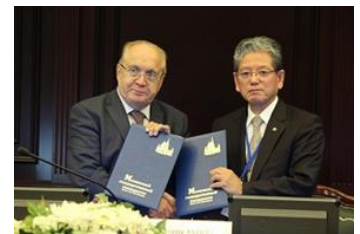
〈Agreement with MSU on a JSD program〉

A Master's Degree student from the TU Graduate School of Science was accepted to study at the Institute of Geology and Mineralogy of the Siberian Branch of the Russian Academy of Sciences.