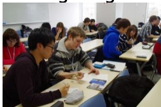
〈 Group work with Russian Students 〉

Short-term cultural exchange programs have already been carried out in both countries. Additionally, semester-term exchange programs to be issued credits have also been successfully completed. Joint seminars on cooperative cutting-edge research have also been held successfully with the aim of graduate level joint education.