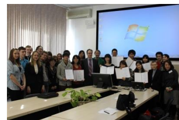
〈 Tohoku University Cross-Cultural Program with Russia 〉