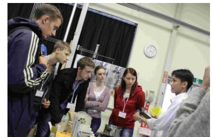
〈 Engineering Lab tour at TU 〉