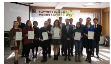
〈Closing Ceremony for exchange students from the MSU's Faculty of Psychology enrolled at the TU Graduate School of Arts and Letters〉