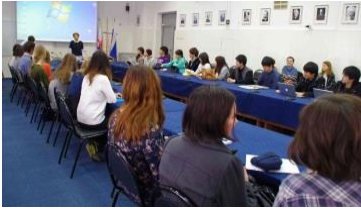
〈 Group work at MSU 〉

A short-term cultural exchange program was carried out at Moscow State University (MSU). For inbound students, in addition to summer programs, there were also specialty programs in Engineering and Psychology. In research and education exchanges, professors give lectures overseas, online seminars, and dispatch of graduate students for short terms. Joint seminars on cutting-edge research were held 11 times. The jointly supervised degree system with MSU is expected to be approved and begin in the next year.