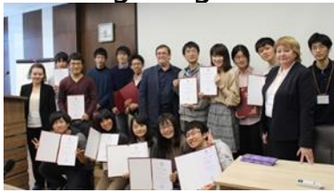
〈Closing ceremony at NSU〉