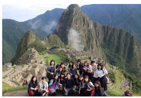
(Peru Study Tour )