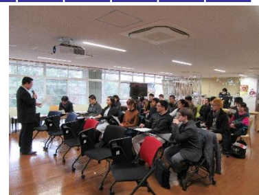
Program Report Meeting (March 2017)

In September of 2016, we held a Joint Program Steering Committee meeting at our university consisting of the heads of the international departments of our partner universities, and held discussions on project follow-up tasks and solutions, including changes to the exchange schedule, a common curriculum, consultation with supervisors, guidance systems, etc.