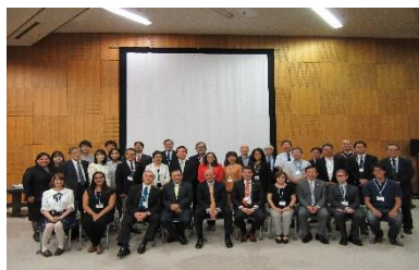
Group photo at the Joint Program Steering Committee meeting with the 5 partner universities (September 2016)

The focus of the Implementation Committee was to promote a strong cooperative system and coordination with overseas partner universities, the setting up of courses, the holding of a meeting of the Steering Committee, and the energetic coordination inside and outside the campus for the smooth implementation of the program.