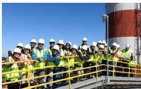
〈Training at timber industry〉