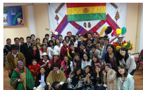
〈 Students exchange at UMSA 〉

As participants in the short-term overseas study in Andean nations, 13 students were selected from 28 candidates by the document screenings and interview tests (academic score, language skills and motivation etc). Spanish language courses at YU and Japanese language courses have been started in Peru, Bolivia and Chile. Pontifical Catholic University of Peru and YU have signed a new agreement for preparation of Double Degree education system.