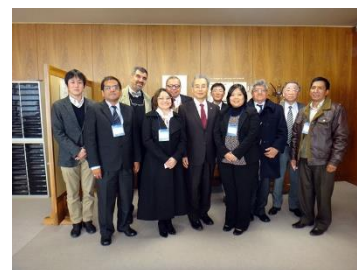
<DTP Manager Meeting in Yamagata in Jan. 2017>

The opening ceremony for our satellite office was held at PUCP in Sep. Now, we can offer basic coordination services and student support locally. Discussions about the future of the program were held at the DTP Manager Meeting in Yamagata together with professors from the six partner universities. Inbound students were selected by conducting interviews using a TV conference system.