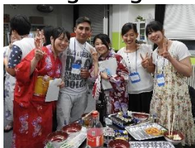
<Inbound students at Yonezawa in Jul. 2016>

A total of 21 students participated in both our long and short-term programs, and this exceeded number initially planned.