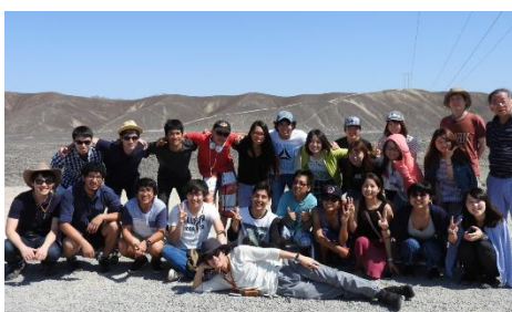
〈Training at institute of Nazca〉