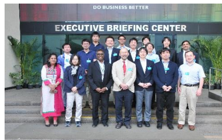
〈 Company visit in Bangalore 〉