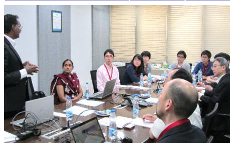
〈 Visiting a company in Bengalure 〉