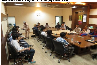
〈 Workshop in India 〉

○JAIST conducted short-term mutual student exchanges aimed to participate in international workshops, accepted undergraduate students from partner institutions as the visiting students, and carried out mutual student exchanges for 1 to 3 months under the collaborative education and research co-supervision program.