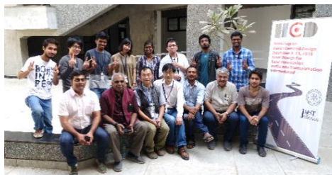
〈Workshop in India〉

OJAIST conducted short-term mutual student exchanges aimed to participate in international workshops, and accepted undergraduate students from partner institutions as special visiting student continuously from FY2014. In addition, JAIST started mutual student exchanges from 1 to 3 months as collaborative education and research co-supervision programme.