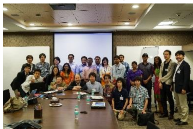
〈 Visiting a company in Bengaluru 〉

○JAIST held international workshops and seminars both in Japan and India, and promoted student exchanges. The one held in Bengaluru, India included visiting to Japanese companies' branch offices and opportunities to hear situation of industry in Bengaluru from staff working there.