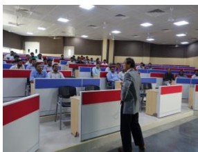
〈 Lecture by NUT faculty in India 〉

In FY 2014, we exchanged faculties and students to discuss about establishment of Joint degree program and quality-assured credit transfer scheme and seek a possibility of overseas internship in both countries. As a part of faculty exchange and trail of cooperative education, both parties gave lecture and supervise experiment at partner university.