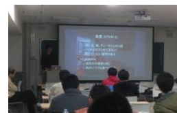
〈 Pre-departure guidance / Report presentation by Japanese students who studied in India 〉