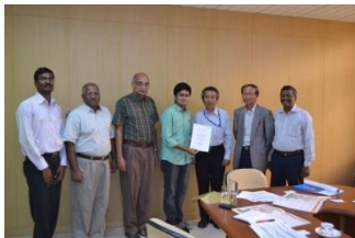
< Grant international student certificate >

In FY 2015, we worked on an establishment of quality-assured credit transfer system and joint degree program between IITM and IITD&M. For the sake of long-term overseas internship expansion, we negotiated with some companies and research institute in Japan and India.