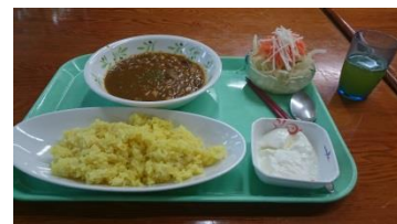
〈 Vegetarian meal 〉