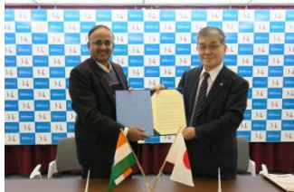
〈 The presidents from NUT and IIITD&M at Signing Ceremony of credit transfer agreement〉

In FY 2016, we continued to work on an establishment of quality-assured credit transfer system and joint degree program between Indian Institute of Technology Madras (IITM) and Indian Institute of Information Technology Design & Manufacturing (IIITD&M).