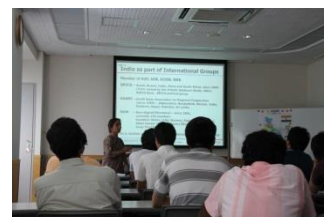
< pre-departure guidance by Indian professor >