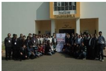
Winter seminar at IIT Kharagpur