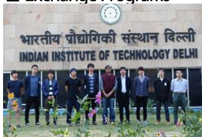
〈Visit to IIT Delhi〉