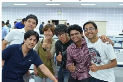
Innovation school at IIT-H

5 programs in progress for promoting India-Japan educational collaboration