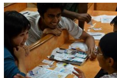
Innovation Workshop at IIT Hyderabad

As part of the comprehensive reformation of undergraduate education, a 4-term system is planned to begin in AY 2015. UTokyo is committed to preserving the quality of the education and making further improvements. The GPA system was introduced from AY 2014 in some courses and will be applied to this project.