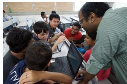
〈WS at IITH〉