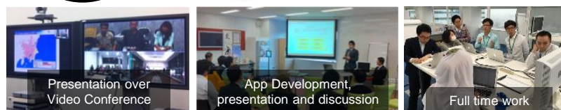
〈 Internship program 〉