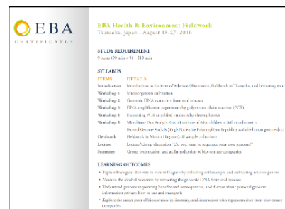
〈EBA Certificate with visualized learning content〉

The consortium has issued a certificate to each participating student who satisfied the course requirements. It contains both the learning contents and the learning outcomes to visualize student’s knowledge and skills. Keio University also awarded official credits to students from both Keio and the partner universities.