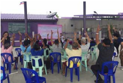
〈 experience for local health class 〉

We carried out the academic degree program which enable students, whose university is a member of our Consortium, to acquire a doctoral degree. One student got the doctoral degree in Health Sciences in March 2016. Two students and one student in medical course will be granted the PhD the degree in Medicine in March 2018 and in March 2019, respectively.