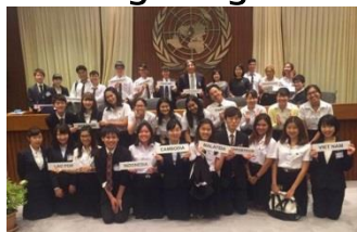
Model United Nations general assembly in Indochina Economic Corridor Excursion Program

Since the adoption of our proposal in 2016, we have been closely consulting with partner institutions about the implementation of student exchange program, and have cleared the target numbers both in inbound and outbound students.