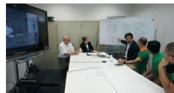
Trial of the Innovative Faculty Development Workshop at the Meiji University ASEAN Center

We have been continuously engaged in the discussion of the detail of the student exchange program and the issues concerning the Quality Assurance of it with our partner institutions. The Department of Architecture and its Graduate School has implemented a trial version of the “Innovative Faculty Development Workshop” with some of our partner institutions, which has, in fact, contributed to deepening mutual understanding of the workshop.