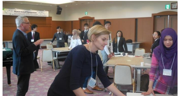
PEACE-SDGs Idea Mining Student Seminar, coordinated by idea mining experts from the University of Münster, Germany