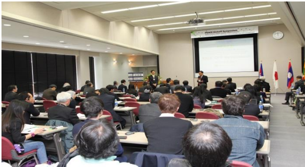
PEACE Student Exchange Program Kick-Off Symposium