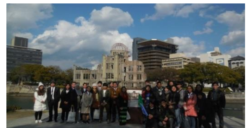
Cultural Study (Hiroshima Peace Memorial Park)