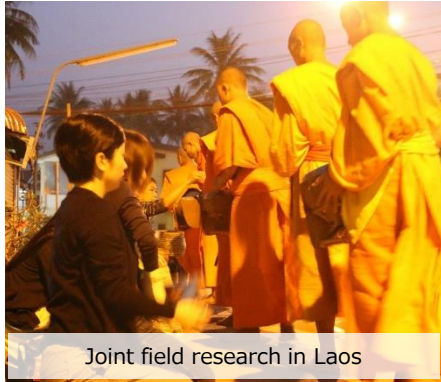
Joint field research in Laos