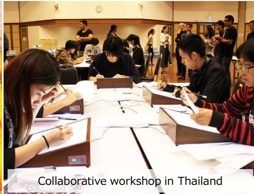
Collaborative workshop in Thailand