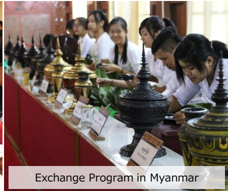
Exchange Program in Myanmar