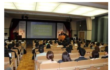
〈2017.4.20 Kick-off Symposium〉