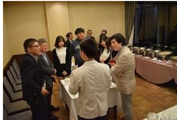
〈2017.4.19 Students and Faculties of 3 universities after Joint Workshop〉