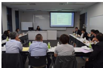
〈2017.4.19 Joint Workshop〉