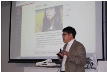
〈2017.4.3 Orientation at Waseda Univ.〉