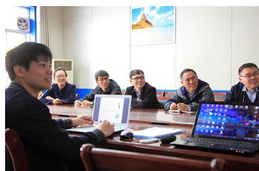
Research Presentation at Shandong University, China