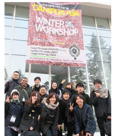
Pusan Winter Workshop in 2017

Sending students We have started offering counseling for students participating study abroad programs. The Education Web system which was installed and started operating will allow us to support educational needs of students during their study abroad period. A seminar will be organized to help them improve their English before going abroad. We will check each universities' lectures and class curriculums to help students to find relevant courses.