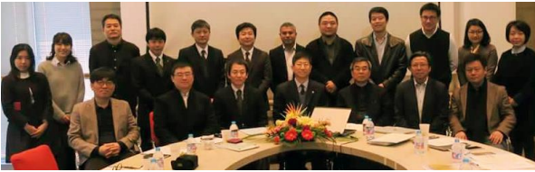
Three Universities Meeting in Shanghai

Five students were sent to China and Busan for short-term exchanges. Twelve students have joined the Pusan Winter Workshop in February 2017. Students from all three universities gathered during these exchanges and shared their experiences.