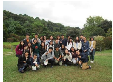
〈Off-campus Learning at Koishikawa Botanical Garden〉