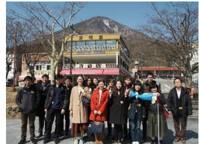
〈Spring Camp in Nikko〉