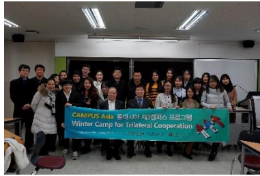
〈WPTC in SNUE〉

From 2016.2.5 to 2.18, SNUE accepted 17 postgraduate students (15 from BNU and 2 from TGU) as the Winter Program for Trilateral Cooperation (WPTC) a part of Campus Asia program. After the 2 weeks stay in Korea, the debriefing session were held at BNU. TGU sent 3 students to BNU for 1 year as exchange students.