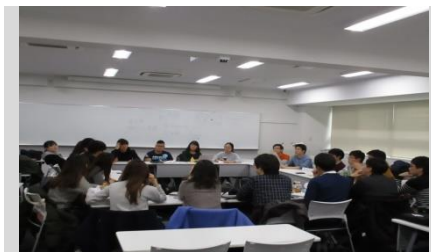
〈Group work during winter program at UTokyo 〉