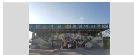
〈On field trip during winter program at SNU〉