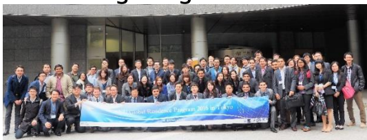
< November, Seoul University Study Tour >