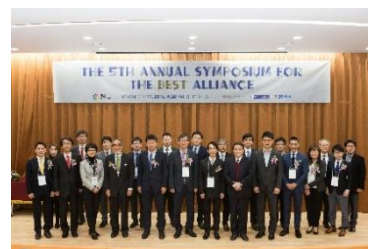
< November, BEST Alliance Symposium in Seoul >

Double Degree Program with Renmin University has been started.