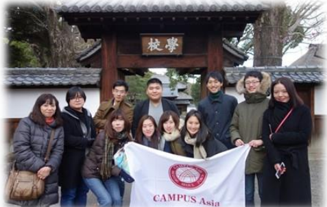
〈Field Trip participated by CJK students and staff January・Tochigi〉

Seven students from PKU and five from SNU were enrolled in Utokyo during the transitional period.