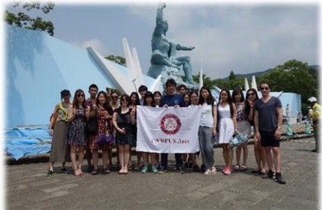
〈CAMPUS Asia Summer Program/ Field Trip August・Nagasaki〉

Each school continuously carried on sending and receiving exchange (EX) and double degree (DD) students after the end of the CAMPUS Asia Pilot Program. During this transitional period, Utokyo sent three students to PKU (one EX and two DD) and one student (DD) to SNU and received seven students from PKU (six EX and one DD) and five from SNU (all DD).