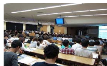
Safety guidance seminar for study abroad