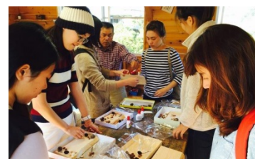
International Exchange Activities organized by AIMS-HU students, Team WAKU WAKU (Funded by Higashi-Hiroshima City)