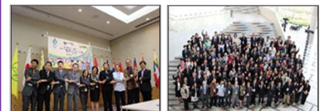
The 9th Review Meeting of AIMS Programme (2015.10 Tsukuba)

JTP course* (Junior Year at Tsukuba Program)