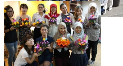
Examples of PBL seminars