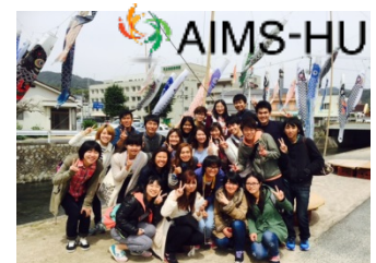
International Exchange Activities organized by AIMS-HU students (Funded by Higashi-Hiroshima City)