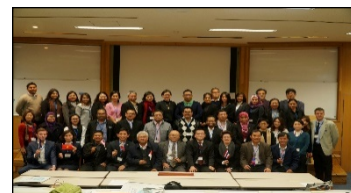
AIMS symposium with partner universities (2015.2 Tsukuba)

JTP course* (Junior Year at Tsukuba Program)