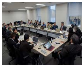
2 nd Partner University meeting