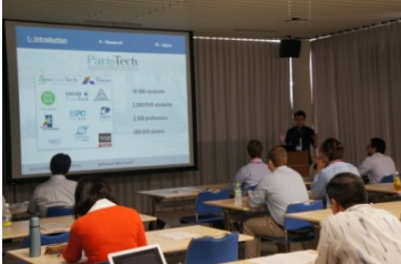
Summer Program student presentation

For each student, academic advisors in universities on both sides maintain communication and, by exchanging Study and Research Plans/Record, provide guidance and advice regarding curriculum studies and research both before and during study abroad period, and after returning to the home university.