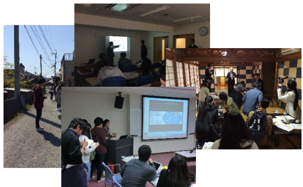
Examples of PBL seminars