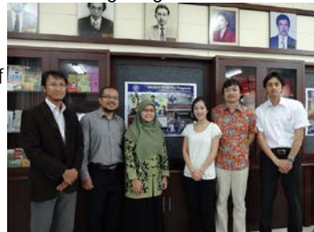
(Visit to Bogor Agricultural University)