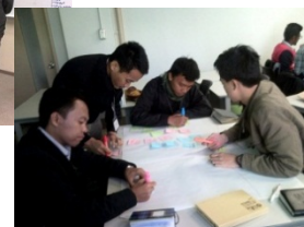
〈AIMS students at a workshop on Sustainability〉