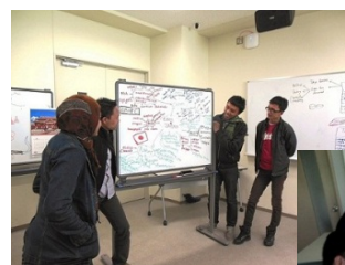
〈A presentation about "Cool Japan" by AIMS students〉