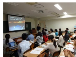
Presentation by outbound students

Emergency procedures by OSSMA (Overseas Student Safety Management Assistance)