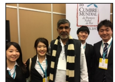
〈With Nobel laureate Mr. Kailash Satyarthi〉

One girl student was selected as a delegate of Japan to attend the G(irls)20 Summit 2016, and participated in the summit taken place in Beijing, China, in August. This summit is a part of the Clinton Global Initiative founded by former U.S. president Bill Clinton, aiming to foster female leading figures of the next generation. Through the discussions and workshops with youth delegates from G20 countries, the participants issued a joint statement regarding “how to create 100 million new jobs for women by 2025” and submitted to the leaders of G20.