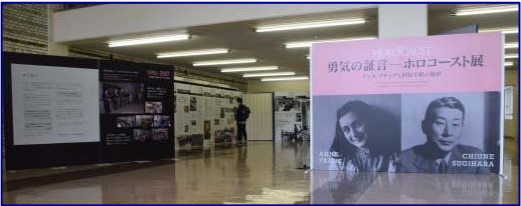
Hosting of a Holocaust exhibition to consider peace and human rights (open to the public)

• Soka University was selected from all universities with comprehensive agreements with Hachioji City, to cooperate for the “JICA Grassroots Technical Cooperation Project.” This is a joint collaboration project with Hachioji City and the Japan International Cooperation Agency (JICA), and all three parties concluded the project contract. To date, faculty members and students of Soka University have been sent 3 times to the Federated States of Micronesia, where the project is being implemented, to conduct public awareness activities aimed at reducing and reusing a large amount of trash in order to reduce the volume of solid waste.