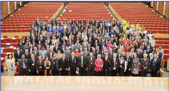
Hosting of the annual ASAIHL conference for the first time in Japan

• Soka University hosted the annual conference of the Association of Southeast Asian Institutions of Higher Learning (ASAIHL) in March 2018, in which about 200 researchers from Southeast Asia, Europe, North America, and Japan participated.