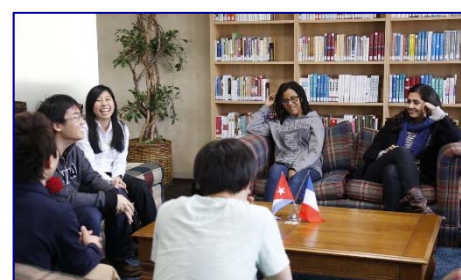
English discussion at an extra-curricular program