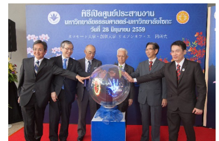
〈Opening of Soka University Thailand Office〉

In FY 2016, total of more than 34,000 students have used the extracurricular programs offered at our learning commons, such as English and other foreign language conversation, writing center, and TOEFL iBT® speaking training, etc. Furthermore, through our unique undergraduate curriculum and various study abroad programs, the number of students who exceed the target language proficiency level of Soka University (equivalent to or higher than TOEFL iBT® 80) increased largely from 296 students at the start of TGU program to 1,035 (13.1% of total students) in FY 2016.