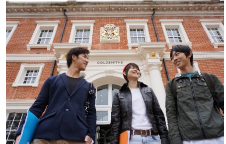
〈 Students of Faculty of International Liberal Arts studying at London University, Goldsmiths 〉

We aim to increase the number of students with overseas experience to 80% of the entire undergraduate students, and students earning credits in overseas universities to 1260 students by fiscal 2023. In fiscal 2014 there were 933 students studying abroad, which includes 78 students in the Faculty of International Liberal Arts (FILA), a newly established faculty where students can graduate by only taking lectures in English. FILA students study abroad for one year from their second semester to four universities in the U.S., U.K., Canada, and Australia, and about 20 students study at each destination respectively. From this fall semester, they are scheduled to take specialized courses in English.