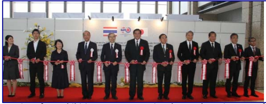
Hosting of an exhibition commemorating the 130 th anniversary of Japan-Thailand Diplomatic Relations (open to the public)