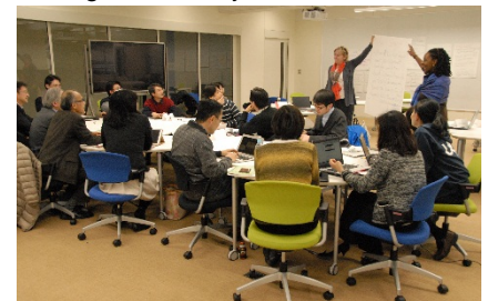
〈 Short-term FD program on campus 〉

In fiscal 2014, we sent 1 faculty to Teachers College, Columbia University for one semester, and held specialized classes to the local students in English. In addition, for the purpose of improving their skills in teaching to non-English students, we conducted a short-term FD program on campus in which we invited two lecturers from the University of Southern California, and 17 faculty participated in the program.