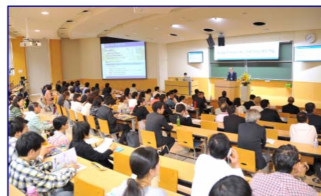
Private University Research Branding Project Symposium