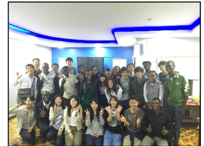
〈Study abroad programs to Africa〉

We newly built short term study abroad programs in Kenya, India and Myanmar in FY 2016, and the participants of overseas internships and volunteers reached 100 and 111 respectively. The target in FY 2023 is 150 student participants for both internships and volunteers.