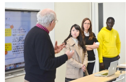
〈English Track to be extended to 11 courses〉

In addition, by making documents in English for meetings that affect the whole university, such as the University Education and Research Council, it is now possible to hold faculty meetings in English.