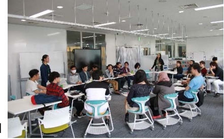
⟨ Global Learning Commons Toyosu Campus⟩

We have been trying to improve our students' English ability by offering regular curricular classes and extracurricular classes such as free online e-learning lessons and the Short-Term English Language Programs. We have been also increasing the numbers of major subject classes offered in English. In addition, we offered special extracurricular lessons focusing on TOEIC® Test and laboratory English conversation. We also introduced TOEIC® S&W trial test and man-to-man Callan method, which is the online course for English conversation from FY 2016.