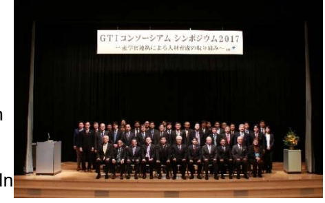
〈 GTI Consortium Symposium 2017〉

We have focused on the quality assurance of education by the assurance program such as Japan Accreditation Board for Engineering Education (JABEE) programs and adopting PDCA cycles. In order to complement conventional teaching method of Passive Learning, we introduced Active Learning such as PBL. In 2017, 67 gPBL were held with partner universities in Japan and overseas with 830 participating students. As for the quality assurance of education, the PDCA cycle is implemented by faculty, clerical staff and students, which enables to improve the quality of PBL continuously. In the process of checking, rubrics and Progress Report On Generic (PROG) skills Test were introduced for objective assessment of students.