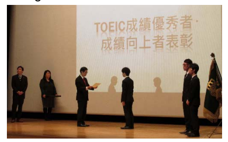
⟨ TOEIC Awarding Ceremony ⟩

4. Initiative to assess, manage, and improve students' language level We have conducted 6 free TOEIC® IP Test a year on campus, as well as the CEFR (The Common European Framework of Reference for Languages: Learning, Teaching, Assessment) to assess students' foreign language