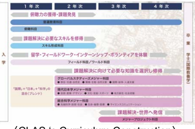
(CLAS 's Curriculum Construction)

Based on the minor program called "International Japan Studies", which is a unique facet of Chiba University, we established a new College in spring 2016, in which, arts and sciences are integrated, so that students will study "Global studies", "Japan studies" and "Sciences" in combination. This will push forward our goal for globalization. The newly formed college will be the driving force for the new education system of Chiba University, including fostering global human resources.