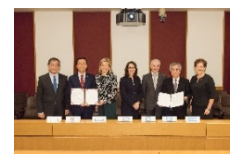
Tokyo Statement signing ceremony

The "Global Network of Research-Intensive University Networks: 2016 International Annual Meeting" international conference was held at Keio University's Mita Campus for two days from November 7 to 8, 2016. The purpose of this conference was to bring representatives from research-intensive university networks from different countries and regions of the world together to discuss common issues, and work towards solutions through mutual collaboration. RU11 (Japan), of which Keio University is a member, has been part of this global network since 2014. In addition to RU11 members, approximately 30 representatives from networks including, AEARU (East Asia), C9 + HK3 (China), German U15, Group of Eight (Australia), LERU (Europe), and U15 Canada participated. Keio University, which is in charge of international matters of RU11, hosted and chaired the conference.