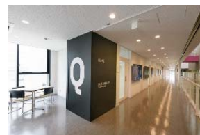
Common Room of the IBM Q Network Hub

An IBM Q Network Hub was established as a center for cutting-edge quantum computer research within the Quantum Computing Center at the Faculty of Science and Technology at Yagami Campus. IBM Q is a cutting-edge quantum computer for general use developed at IBM (United States), and this will become the sole hub in Asia enabled to use IBM Q's cloud computing system. The hub will contribute alongside four corporate members to quantum computer studies, skill development, and implementation, with the aim of facilitating advances in quantum computing. Keio University, with developers from participating corporations, will access the 20-quantum-bit commercial IBM Q quantum computing system equipped at the New York State hub through the cloud, and thus promote development of quantum applications in close cooperation with educators, researchers, and students.