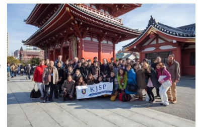
Keio Short-Term Japanese Studies Program

The development of short-term programs is underway to increase the number of international students who come to Keio. Thesis@Keio, a program geared towards graduate students, began in 2015. Graduate students at the master's or doctoral level who are accepted to the program are allowed to conduct research at Keio and gain access to university resources. They may conduct fieldwork and interviews and receive advisement from Keio faculty members for their research. This new system provides students from other universities direct access to Keio academic faculty in order to further their research while Keio benefits by building an international academic network with talented graduate students and early-career researchers from abroad. Additionally, numerous new programs are slotted for Summer 2016 and beyond across many different faculties and graduate schools.