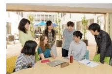
Hiyoshi International Dormitory