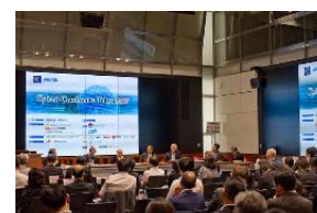
During the symposium

This symposium, jointly hosted by Nikkei Inc., Nikkei Business Publications, the Cyber Security Research Center at Keio University, and other entities, saw many lectures, panel discussions, and workshops with various themes. These included: "Next Generation Security Operation Center for the AI Era"; "Leadership for Cybersecurity Management"; and "Roles and Responsibilities of the Government and Private Sectors." A signing ceremony was also held at the opening of the symposium proceedings for an academic partnership agreement with the Georgia Institute of Technology as part of the activities of INCS-CoE. Lively industry-government-academia exchanges, bringing together governmental actors and prominent experts in the cybersecurity field and delegates from universities participating in INCS-CoE from Japan and overseas, were seen at the venue.