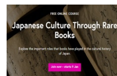
FutureLearn registration page

Keio University signed a Course Distribution Agreement with FutureLearn, the UK-based MOOC provider, making it an official member and the first from Japan to join the platform. In the 2016 academic year, two courses were provided: “Japanese Culture Through Rare Books” which looks at Japanese culture through writings from the earliest period in which books were written in Japan (8th century) to the Meiji Period (1868–1912), and “An Introduction to Japanese Subcultures” in which students study Japanese youth culture from the 1970s onwards. Both courses were taken by many people from around the world and received good reviews.