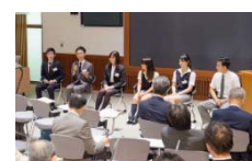
Study abroad debriefing meeting

The program was launched in 2014, and in July 2016 a debriefing meeting was held with members of the first group of students who participated in the program. It was apparent that by living with the brightest students from around the world and interacting with them through studying and extracurricular activities, the students were able to not only improve their English, but gain new perspectives and the ability to proactively take action and seek new challenges. It is hoped that these students will create a ripple effect of inspiration among their classmates.