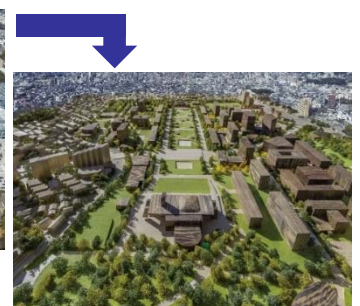
< Thirty years later >