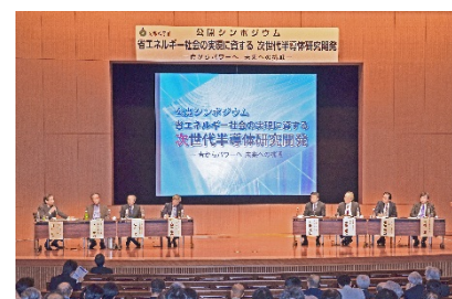
〈 Public symposium 〉

Nagoya University was selected to be included in MEXT's 2016 Project "Research and Development of Advanced Semiconductors that Contribute to Establishing an Energy-Efficient Society" for our efforts in utilizing the GaN Research Consortium which was established in October 2015 with involvement from all around Japan. Henceforth, Prof. Hiroshi Amano of the Institute of Materials and Systems for Sustainability will become our research representative and work to accelerate the research through Academia-Industry-Government collaborations towards the early applications of advanced materials such as GaN, etc., with Nagoya University as the center of such efforts.