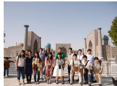
〈 Overseas study tour in Uzbekistan 〉

In 2015, programs consisting of coursework both inside Japan and overseas were opened as Liberal Arts and Sciences courses (4 Liberal Education Courses in Interdisciplinary Fields, 3 Literary and Cultural Studies). To take the 4 Liberal Education Courses in Interdisciplinary Fields for example, they were designed to each consist of clear and unique content and implemented with the expansion of the program (USA, Uzbekistan, Thailand, UK). Participants were able to achieve objectives such as experiencing the global expansion of the place of learning (USA) and acquiring the fundamental attitude towards future academic research (Uzbekistan, Thailand, UK). These achievements have been shared both internally and publicly through publications or oral presentations, etc. 101 students participated in NU-OTI courses in 2015, and the total number of students dispatched from Nagoya University this year reached 1,013 (Last year, 605).