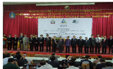
〈 Opening ceremony of Asian Satellite Campuses in Laos 〉