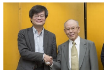
<Distinguished Professor Akasaki (right) and Distinguished Professor Amano (left)>

Nagoya University has strived to promote an energy saving society since Distinguished Professor Akasaki and Distinguished Professor Amano were awarded a Nobel Prize in 2014. We have also taken the initiative to work towards the establishment of the GaN (Gallium Nitride) Consortium within 2015, in which public and private sectors jointly conduct research for the GaN crystal growth, GaN-based device development, and the organization of a research system. This effort attracts a great deal of interest and 40 organizations, including over 20 companies, participated in the discussion meeting for the GaN Consortium establishment.