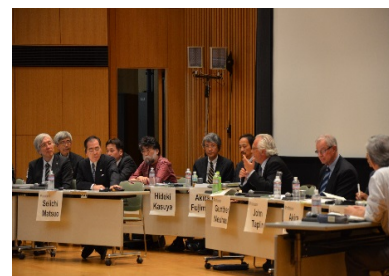
<President and directors listening to IAB>

We held a symposium in May 13, 2015 for all faculty members to share information and better understand our strategies and goals for becoming a leading university in the world. Each member in charge fully explained each strategy and action plan (strategies to implement in 2015-2017), and over 550 members attended the symposium. We also invited 4 members from the International Advisory Board (IAB), including foreign teachers, and had a panel discussion about our strategies and their problems with the president and department directors. The symposium was successful to the point that it was necessary to extend the time due to the large number of questions.