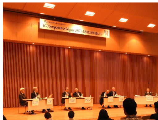
<International Symposium on Feb 17, 2017>

On February 17, 2017, the University hosted an international symposium to recognize and share the results of the efforts made for these programs during the previous two and a half years, inviting an International Advisory Board composed of former university presidents. The members shared many valuable opinions and words of encouragement directed at the programs, such as: "The University's aspirations and strategies in implementing these programs are all outstanding. I can see the university has already been making significant progress, and it seems you are proceeding in the right direction. I would like to give you all a big round of applause."; "These joint degree programs will not only result in doctoral degree conferment, but I expect the university will be able to enhance both the quantity and quality of research collaboration with overseas universities, and create a cycle for improving the quality of research papers, promoting education and research funding, and attracting talents."