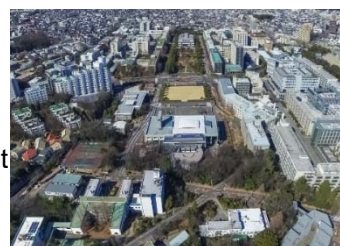
< Current conditions >

These initiatives received favorable evaluation and were awarded the first MEXT Infra-maintenance award established by MLIT, MIC, MEXT, MHLW, MAFF, and MOD.