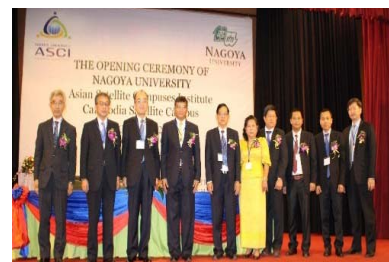
<Campus opening ceremony in Cambodia>

We established satellite campuses and started accepting students in Mongolia, Cambodia, and Vietnam. Local residents were actively employed as designated lecturers and administrative staff. Environmental preparations were made as necessary with the cooperation of local partner universities, such as the construction of educational and research facilities. Our institute enables students to study as NU students without needing to be away from their workplace in their home countries, providing easy access to our programs and thus contributing to the internationalization (diversification) of NU.