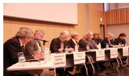
〈 A Commemorative Symposium on October, 2015 〉