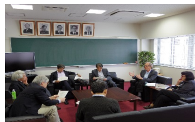
<Discussion on Intercontinental Academia at NU>

UBIAS (University-Based Institutes for Advanced Studies) is an organization that aims to promote a network between national institutes of advanced studies of universities around the world and stimulate international research exchange. Currently, Nagoya University is playing a central role in the planning and operations of the "Intercontinental Academia" project which seeks to nurture leaders of the next generation in collaboration with the University of São Paulo Institute of Advanced Studies. A workshop was held at the University of São Paulo in April 2015 and the next workshop is planned at Nagoya University in March 2016. Nagoya University and the University of São Paulo have discussed, during 2014, the contents and management of the program, and how to recruit applicants over the internet.