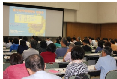
<Orientation on Savings Accounts system for studying abroad>

Savings Account system, in which students interested in studying abroad save 10 thousand yen a month, was established in 2015. In case the deposit is not enough for studying abroad, he/she can borrow the necessary amount from the university's loan system without interest. Over 200 people attended the orientation held for parents and guardians in May 2015. This system began in 2015 and we estimate that about 400 students will have utilized this system by 2017.