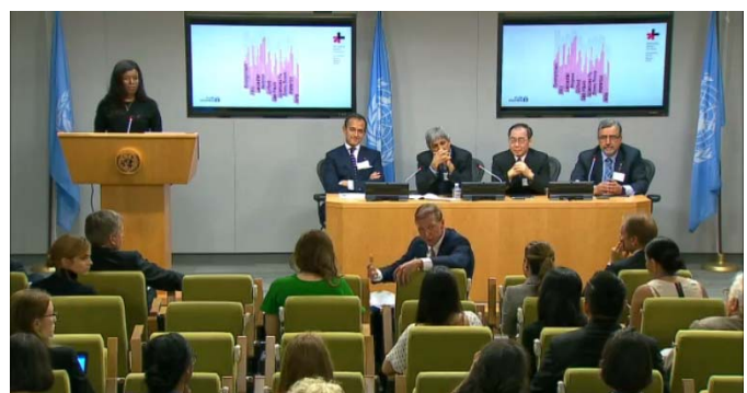
< HeForShe IMPACT 10 × 10 × 10 University Parity Report >