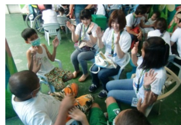
〈Rikkyo Service Learning Program〉