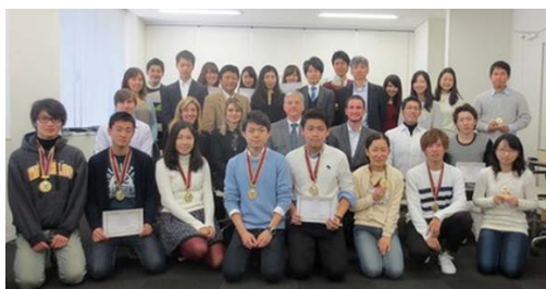
〈Commendation ceremony of the 12 th CLUB900 award in College of Business〉

Starting in the academic year 2016-17, the new university-wide admission procedure will be introduced. Instead of the conventional English test, the score of standardized English proficiency tests (such as GTEC CBT, TEAP, TOEFL and IELTS) will be used to evaluate the applicants' English proficiency in the four skill areas of listening, speaking, reading, and writing. The paper tests will be conducted in two subjects. Rikkyo University decided to introduce the new type of admission in 2014 and has been planning the procedure at the moment.