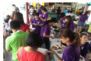
New Study Abroad Program in Philippines

Rikkyo University has become capable of providing a wide variety of study abroad experiences suited for the diverse needs of the students in term of schedule, locations, purpose as well as contents, due to the fact that each college and department has been actively developing new programs. In the academic year 2015, College of Economics launched new programs for its students to learn economics in English at multiple locations, including United Kingdom, Australia and Philippines, with the total participation of 41 students. International Office also started a new short-term English language program in Australia with the total participation of 27 students. Furthermore, Organization for Global Initiatives (OGI) has hired four Education and Research Coordinators for the purpose of assisting the administration of study abroad programs operated by each college and the newly hired coordinators have been able to streamline the operation of study abroad programs effectively by organizing the activities such as information sessions, pre-departure orientations and re-entry meetings. In the academic year 2015, the total number of the participants in international programs has been increased to more than 1,000 students, combining both curricular and extra-curricular programs.