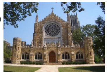
The University of the South (the U.S.) (One of partner institutions for GLAP students)

To prepare for the opening of GLAP scheduled in April 2017, the university has been examining and developing the policies pertaining to curriculum development, entrance examination, new partnerships with overseas institution for required study abroad component, and scholarship funds. Based on the long tradition of Rikkyo University's liberal arts education, GLAP provides the comprehensively packaged academic program, including the liberal arts education conducted in English in small-sized classes, the required study abroad to overseas liberal arts institutions starting in fall semester of second year, and the in-depth specialized education, chosen from the three options of "Humanities," "Citizenship," and "Business," after the students' return to campus. The admitted students are required to live in dormitories with international students for a year and half between their entrance to the university and the departure to study abroad. In the academic year 2016, GLAP Preparatory Office is established and the university continues its efforts to start the admission of the students in the academic year 2017.