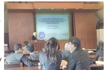
A visit of the student groups from Indonesian partner institutions

As the intellectual contribution to global society by human recourse development, the International Cooperative Graduate Program, which could be entirely completed in English, starts to admit the international students, mainly from Indonesia in September 2016. In the academic year 2015, Master of International Business (MIB) program at the Graduate School of Business opened a new academic specialization called Master of Public Management and Administration (MPMA) and the university examined and prepared the concrete plan for the program curriculum and entrance examination. Moreover, the university signed new partnership agreements with four national universities in Indonesia and now cooperates with the total of six Indonesian institutions of higher education. When the university received a visit of the student groups from partner institutions, the university staff introduced the program curriculum to the visiting students. The entrance examination was conducted during the academic year 2015 and three prospective students are scheduled to be admitted in 2016 at this time.