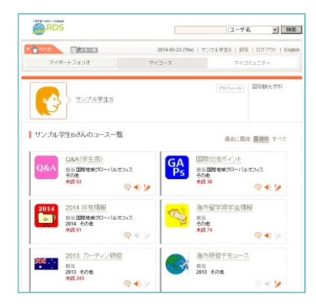
\( \begin{align*} Visualization of Learning \) Outcome through E-portfolio>

Through the Toyo University - UCLA Extension Center for Global Education, joint courses will be developed for all generations for a total of 500 courses and 10,000 participants by 2023.