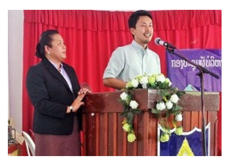
<The Tobitate program>

Toyo University aims to raise the number of international student admissions to reach 5% representation in each faculty (a total of 296 daytime students). Efforts are underway to strengthen this intake university-wide, including for short-term programs. Short-term programs will be opened in summer 2016.