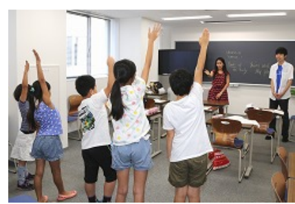
<Toyo Achieve English>