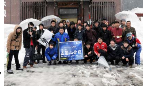
(Camp in Gokayama with President

As a part of Empowerment Programs, "Camp in Noto with President" took place in August, 2014, and "Camp in Gokayama with President" in February, 2015. 66 students in total joined the events. Empowerment Programs were implemented to train human resources equipped with the 5 abilities indicated in KUGS, physical strength and human resilience.