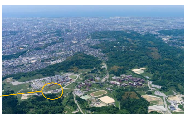
⟨ Student/International Student Dormitory "SAKIGAKE I" ⟩ ⟨ Kakuma Campus, Kanazawa City and the Sea of Japan ⟩