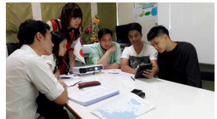
〈 GIGAKU Techno Park Office in Thailand 〉

As overseas bases (GIGAKU Techno Park), a joint office was newly established in Chulalongkorn University in the city of Bangkok, Thailand and Universiti Sains Malaysia in Penang Island, Malaysia , respectively. A coordinator is stationed in each office to promote cooperation with Japanese-affiliated companies. The offices are the fourth and fifth offices, following those of Mongolia, Vietnam, and Mexico.