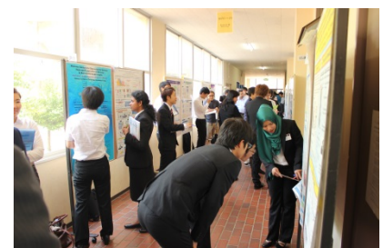
〈 4 th International GIGAKU Conference in Nagaoka 〉

Using the Super GI-net established at the University of Guanajuato, Mexico, a debriefing session was held with our students on overseas internship.