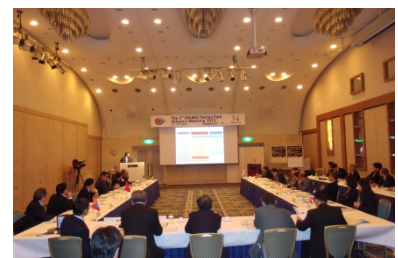
〈 The First GIGAKU Techno Park Alliance Meeting 〉

Furthermore, to systematize the curriculum and construct an academic affairs system that secures the international interchangeability of credits based on international collaboration between KOSEN and universities of technology, we have conducted translation of the model core curriculum into English and have prepared to ensure the continuity of GIGAKU education with KOSEN established at overseas countries.