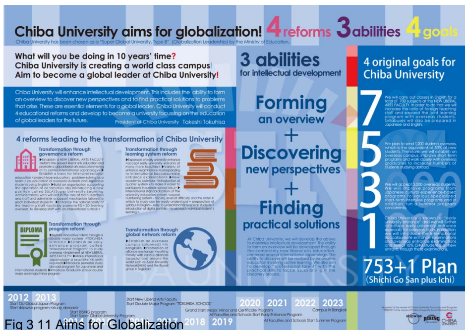
Fig 3 11 Aims for Globalization

In the global network reform, we will conduct two major activities: establishment of an overseas campus and interaction among the group of universities affiliated with Chiba University. We will open an overseas campus at Mahidol University in Thailand. The overseas campus will offer experience-type short-term study abroad (training studio) programs, professional education programs, Off-Shore programs, double-degree programs, and joint-degree programs for undergraduate students, and provide international joint research labs (horticultural science, bioscience).