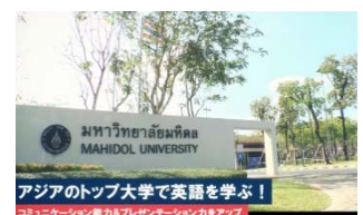
<Study Program PR Video in Mahidol>

In order to strengthen ties with Mahidol University and open a satellite campus, we are pursuing various cooperative activities with this university in Thailand. We will send over 200 undergraduate students per year, establishing a strong coalition with them. Also, we have established a Berlin campus in Charité - Universitätsmedizin Berlin/Humboldt Univ. (Germany) and a San Diego campus for life science in University of California, San Diego (USA). We have begun to operate 3 overseas campuses from FY 2016.