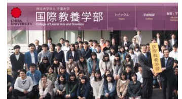
〈CLAS 's Website〉

Based on the “International Japan Studies program for major subjects (minor subject)”, which is a unique facet of Chiba University, we established a new College in spring 2016., in which, arts and sciences are integrated, so that students will study “Global studies”, “Japan studies” and “Sciences” in combination. This will push forward our goal of globalization. The newly formed college will be the driving force for the new education system of Chiba University, including fostering global human resources.