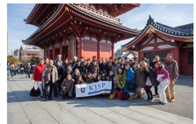
Keio Short-Term Japanese Studies Program

The development of short-term programs is underway to increase the number of international students who come to Keio. Thesis@Keio, a program geared towards graduate students, began in 2015. Graduate students at the master's or doctoral level who are accepted to the program are allowed to conduct research at Keio and gain access to university resources. They may conduct fieldwork and interviews and receive advisement from Keio faculty members for their research. This new system provides students from other universities direct access to Keio academic faculty in order to further their research while Keio benefits by building an international academic network with talented graduate students and early-career researchers from abroad. Additionally, numerous new programs are slotted for Summer 2016 and beyond across many different faculties and graduate schools.