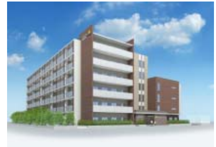
3D rendering of Hiyoshi International Dormitory* (*Name tentative)

Keio has gradually added international housing with the increase in international student numbers, and in March 2016 the university opened the doors to the Okurayama Dormitory, the university's newest housing complex designed with international students in mind. In March 2017, Hiyoshi International Dormitory*, the university's first attempt at a truly international dormitory, is slated to open. Additionally, Keio has plans to open another international student dormitory at Tsunashima Sustainable Smart Town in Yokohama by March 2018.