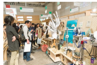
Open Research Forum

In 2014-2015, Keio's research greatly exceeded many of its research targets. For example, the total amount of commissioned research grew 23% to 64 billion yen, and the total number of domestic/foreign patents grew 53% to 988. The University also established a hub for collaborative research with the U.S. National Institute on Aging, a world leader in aging and longevity research.