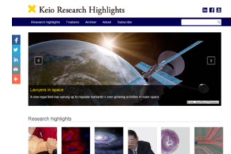
Keio Research Highlights

The Global Interdisciplinary Courses (GIC) Center was established in 2014 to design the GIC Program, which started in April 2015. Keio's first university-wide curriculum conducted in English, the GIC Program is available to students across all of Keio's undergraduate faculties and graduate schools and will function as a platform that works towards developing courses which allow more students to study and graduate in English. The GIC Program launched with 13 Core Courses and 172 Research Courses that offer GIC credit.