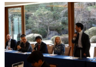
The Internet in Asia: Looking Ahead to 2025

The University has established a discretionary fund for the President to use swiftly and flexibly in order to inject funding and accelerate reform. This fund has made it possible for the University to prioritize and selectively consolidate resources on exceptional projects in need of funding. This fund helped bring together leaders from the business, academia, and government from throughout the Asia-Pacific region for candid discussions concerning key issues for the future of the Internet at the Association of Pacific Rim Universities' (APRU) Internet Business Offsite: "The Internet in the Asia-Pacific – Looking Ahead to 2025," which was held from March 10-11, 2015, at Keio University.