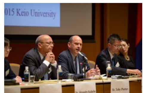
International Conference on Cognitive Decline and its Economic Consequences Co-hosted by Keio University and the World Economic Forum

Keio Ageing Week was held from Sunday, October 4, to Friday, October 9, 2015. Organized by Keio University with the collaboration and cooperation of various organizations, including the World Economic Forum (WEF), the World Health Organization (WHO), and Osaka University, the week consisted of an international conference and various events including lectures focused on healthy ageing, or more specifically, exploring solutions to challenges related to an ageing society. World-leading researchers convened to discuss issues related to a super-ageing population and cognitive decline as part of Keio University's ongoing research on longevity, one of Keio's global initiatives and a field in which Keio has long had a strong reputation. This meeting provided new insights needed to spark joint research on building a society that can cope with an ageing population through ongoing interdisciplinary and international research.