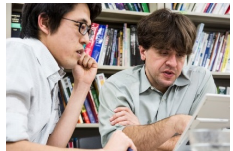
A visiting research co-advisor meets with a Ph.D. candidate

The university commenced full operation of its cross-appointment scheme to employ researchers from abroad as visiting research co-advisors to advise doctoral candidates at Keio. In AY2015, Keio welcomed a total of 60 co-advisors. Just as the year before, all parties involved—main research advisors, visiting research co-advisors, and doctoral candidates—expressed a high degree of satisfaction with the scheme. Several joint research and co-authored papers have been or are currently in the process of being published. The university expects their contributions will have a positive impact on citation and ranking indices.