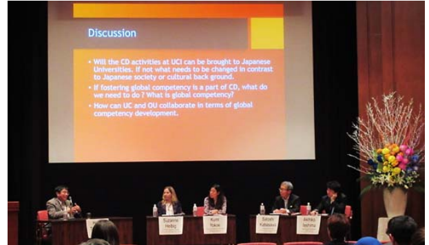
1-(1). Panel Discussion at the UC/UCEAP Osaka Office First-year Anniversary International Symposium

Osaka University is a member of the Association of Pacific Rim Universities (APRU), comprised of top research universities in the Pacific Rim area. In June 2015, Osaka University hosted prestigious APRU's Annual Presidents Meetings with the theme "University as an Agent for Global Transformation." The meeting hosted 106 guests—including 25 presidents—and composed of panel discussions that revisited the mission of universities in the 21st century and discussed the university's role as a proactive instrument of global transformation.