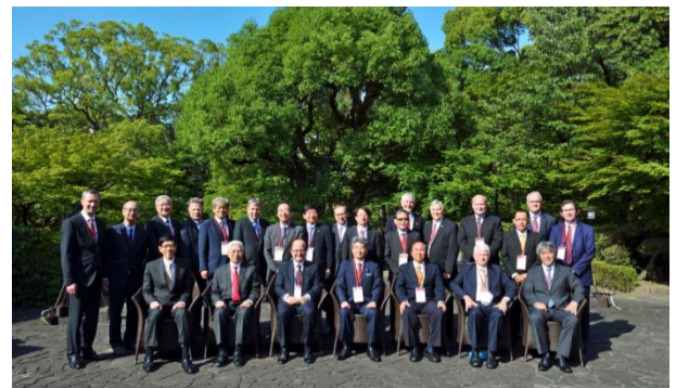
4. Association of Pacific Rim Universities (APRU) 19th Annual Presidents Meeting