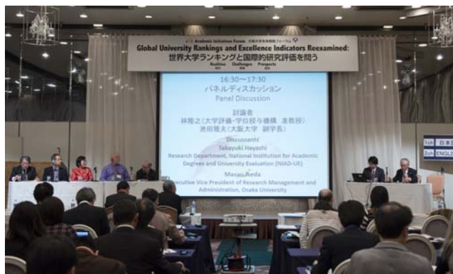
2. Academic Initiative Forum “Global University Rankings and Excellence Indicators Reexamined”

In addition, Osaka University provided financial support to international joint conferences (supporting 15 events), research abroad programs (supporting 9 events), and visiting scholar programs (supporting 3 programs). This funding was made possible by the Program for Promoting the Improvement of Research Universities, funded by the Ministry of Education, Culture, Sports, Science and Technology.