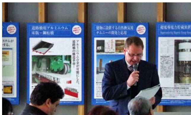
1. 2014 International Joint Research Promotion Program Workshop