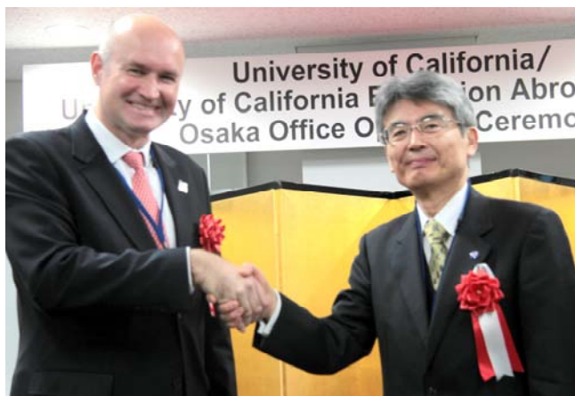
UC/UCEAP Osaka Office Opening at Osaka University