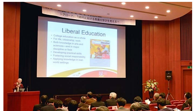
1-(2). Keynote Lecture at the Top Global University Project International Symposium