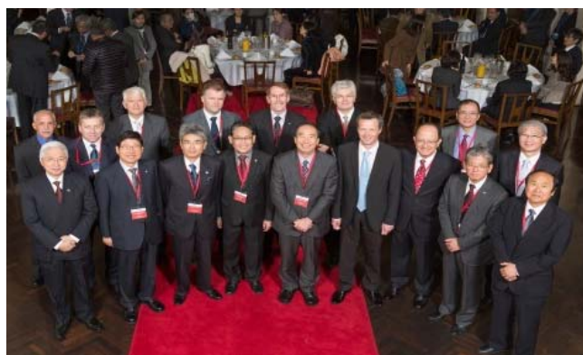
3. Association of Pacific Rim Universities (APRU) 18 th Annual Presidents Meeting