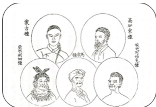
Blumenbach’s influence on Meiji textbooks (Takezawa 2015)