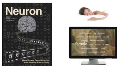
Figure 1 Neural decoding of visual information

In this project, we collect brain activity data using functional MRI (fMRI) while participants are seeing images (Perception), having mental imagery (Imagery), or having dreams (Dreaming) (Figure 2). In addition to decoding analyses within each dataset, we perform generalization analyses in which a decoder trained on a dataset is tested on another dataset. Using the generalization performance as an index for the similarity of neural representation, we systematically and exhaustively