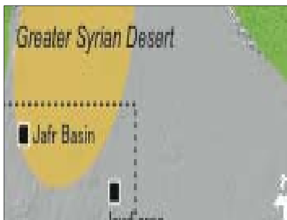
Fig. 1 Fertile Crescent and its outside

Our research objective is to shed new light on the formation process of the nomadic society in the Near East through comprehensive investigations in the northwestern part of the Arabian Peninsula, the core of the epoch-making episode. It aims to trace: 1) the appearance process of short-range pastoral transhumance in the Pre-Pottery Neolithic B period; 2) the establishment process of initial pastoral nomadism during the Late Neolithic to Chalcolithic periods; and 3) the formation process of nomadic society in the Early Bronze Age. We would like to re-measure the original depth of the Near Eastern Prehistory through the cross-border, comprehensive investigations and, in so doing, reform the traditional Near Eastern archaeology that has long been focused on the Fertile Crescent.